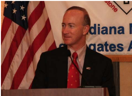
Governor Mitch Daniels