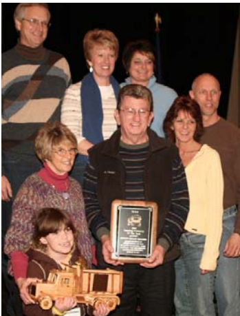
Trucking Company of the Year Richard Gilliatt Trucking