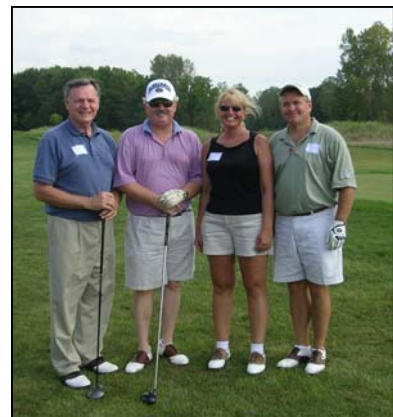
Golfing for a great cause!